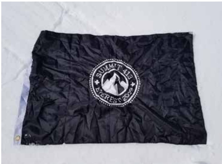
SUMMIT 413 FLAG WITH YOUR LOGO

Have your logo seen by millions and immortalized on Everest.